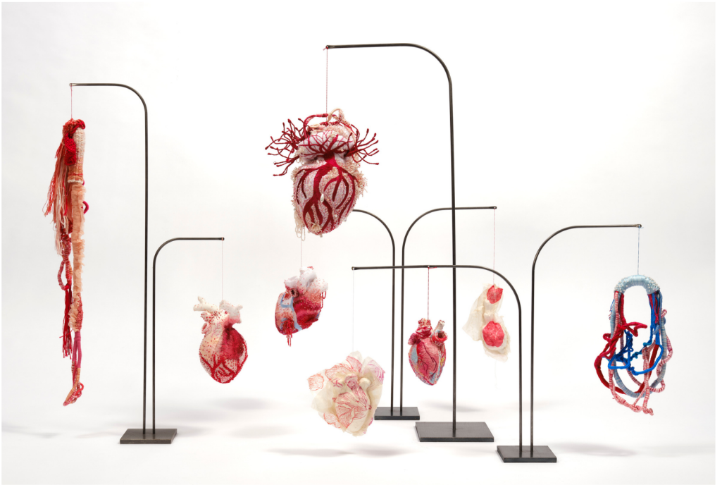
Image: Hearts of Absent Women 2021-2023, embroidery, cotton, linen, wool, glass beads, vintage beads, hanji paper, lokta paper, polyester. Dimensions variable.