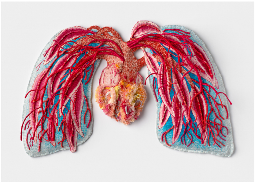
Image: Soft Alchemy (Fertile Heart) 2019, woven tapestry, cotton, wool, wire. 54 x 80 x 6cm.