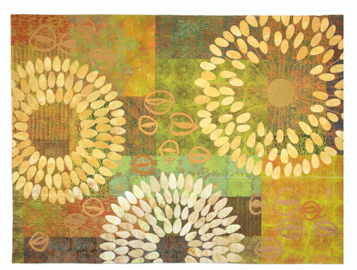
Susan Mathews, Coastal Life, 2013 (detail) quilted/sewn fabric, 108 x 148 cm Acquired as winner of Golden Textures 2013, Collection of Central Goldfields Art Gallery © The artist and Central Goldfields Art Gallery

With thanks to the team at Central Goldfields Art Gallery.