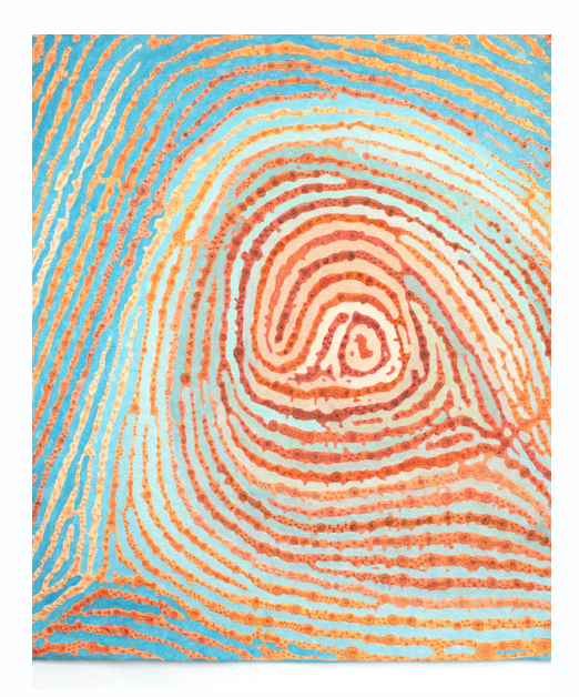
Sue Reid, Australian Print, 2019 (detail) hand painted with acrylic paints, hand embroidered and machine quilted. Cotton fabric, wool and polyester wadding, embroidery thread, 87 x 97cm Acquired as winner of 2019 Golden Textures, Collection of Central Goldfields Art Gallery © The artist and Central Goldfields Art Gallery

The next Golden Textures Art Award will be held at Central Goldfields Art Gallery in Maryborough in 2023.